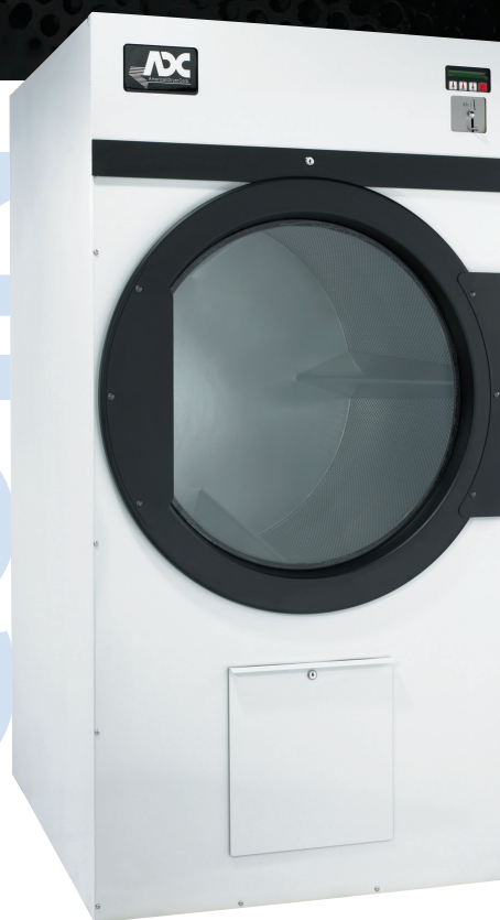
AD-758V Coin Dryer