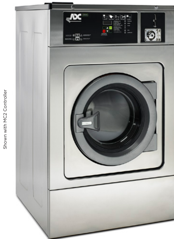
Shown with MC2 Controller