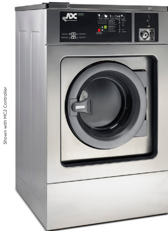
Shown with MC2 Controller